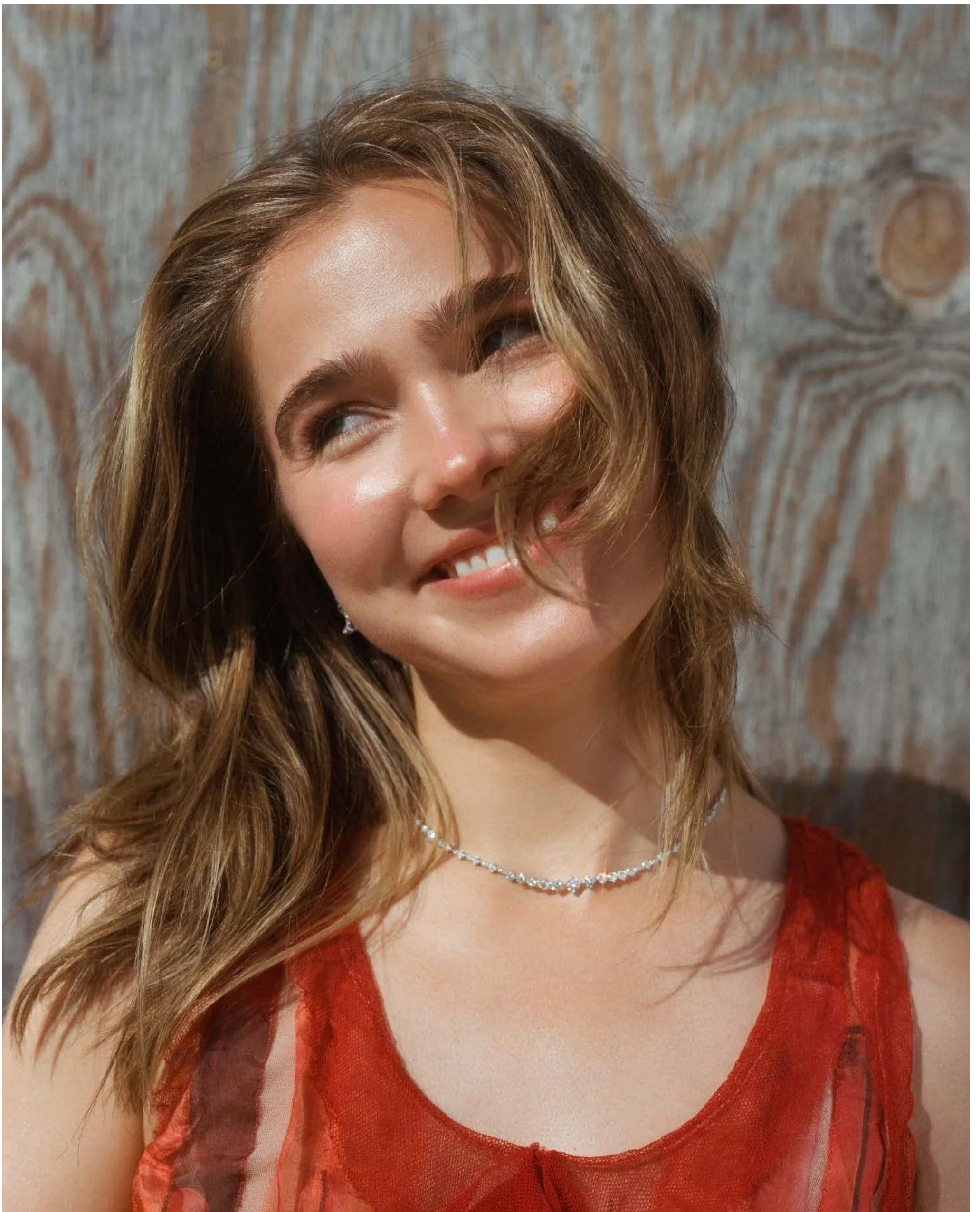
NECKLACE DE BEERS • TOP VINTAGE JEAN PAUL GAULTIER, ARTIFACT NY

So, are there any diamond pieces that you wear regularly? Special purchases, maybe?