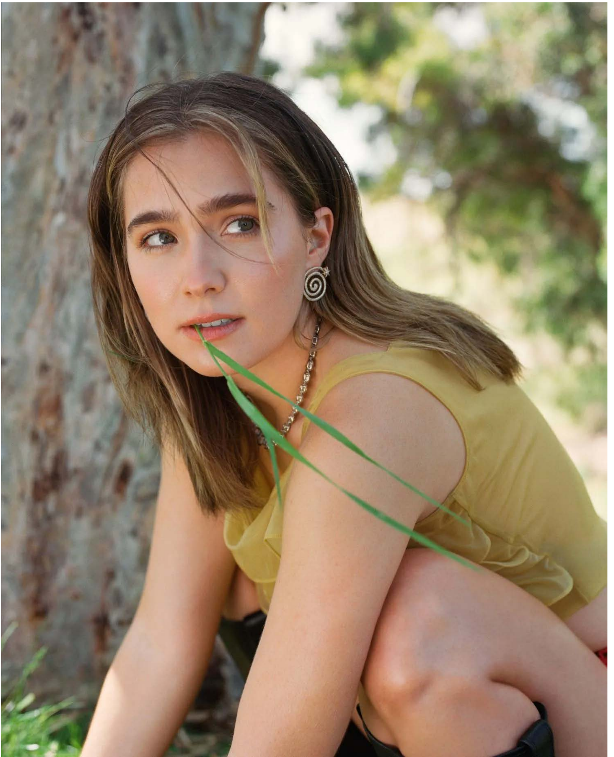
EARRINGS AMINA SOREL • NECKLACE DE BEERS • TOP VINTAGE HELMUT LANG, ARTIFACT NY • BOOTS FRYE