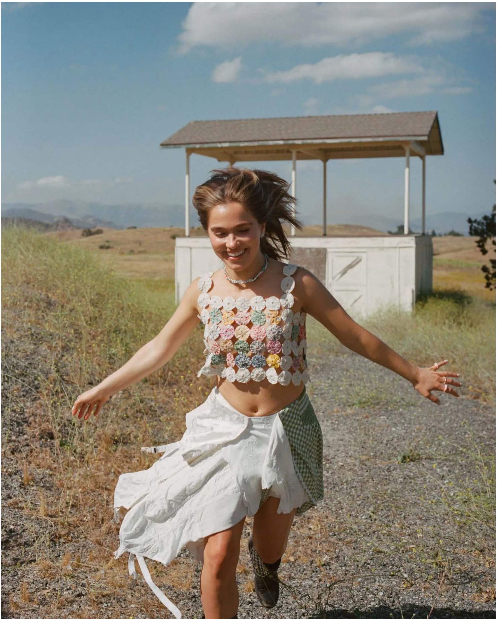
EARRINGS STEPHANIE GOTTLIEB • NECKLACES ADINA REYTER, SUSAN EISEN • RINGS BOOCHIER • TOP AND SKIRT KIMBERLY CORDAY • BOOTS FRYE