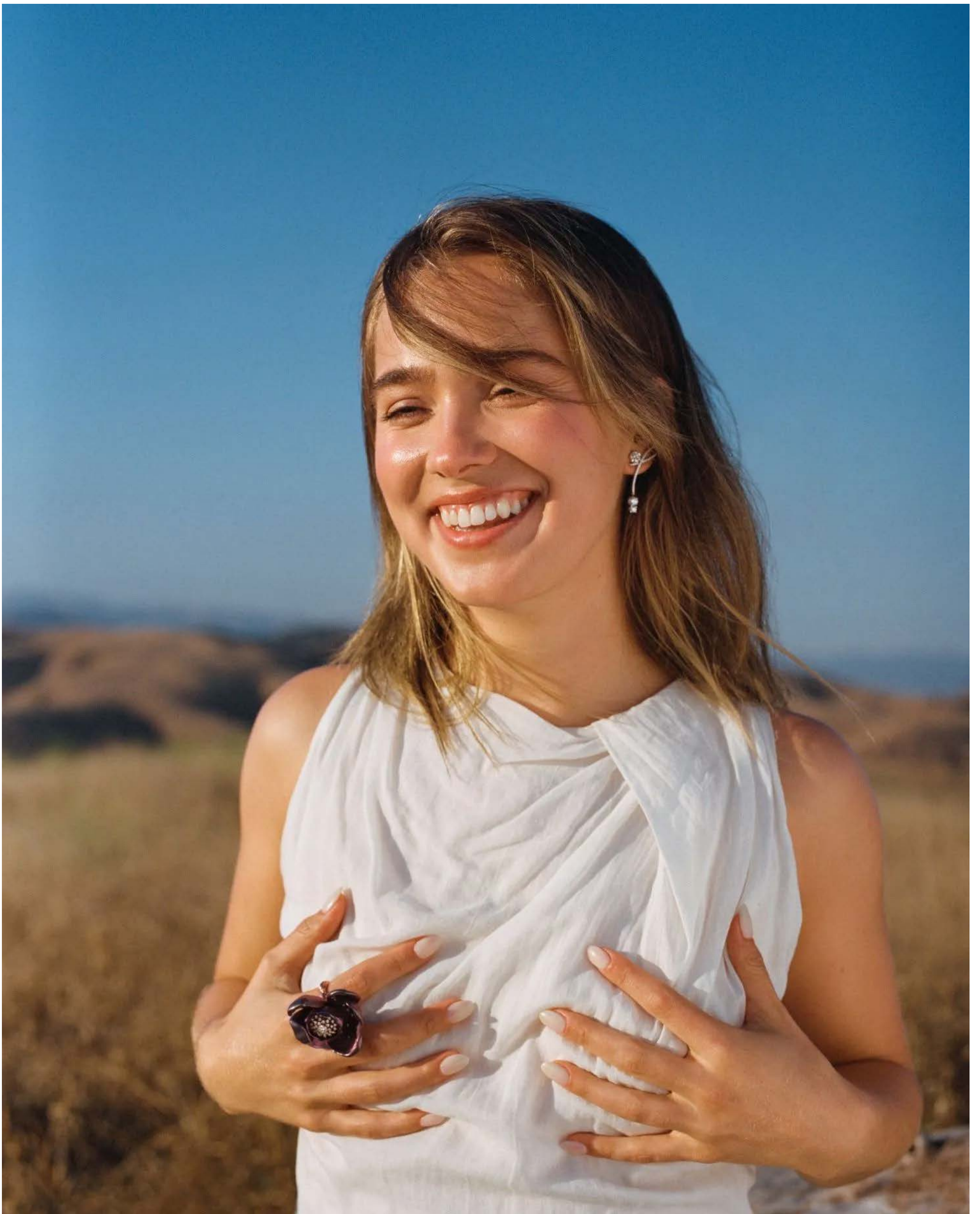
EARRINGS SUSAN EISEN • RING GRAZIELA • DRESS VINTAGE VIVIENNE WESTWOOD, RESURRECTION LA