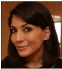
Celebrities and Stylists Admiring Jewelry from Susan Eisen at the StyleLab Suite During Academy Awards Week

LOS ANGELES, Feb. 22, 2015 /PRNewswire/ -- Celebrities and top Hollywood wardrobe stylists admired jewelry from Susan Eisen at the StyleLab Suite, which took place during Academy Awards week. The collection includes handcrafted, one-of-a-kind earrings, necklaces, bracelets, and rings.